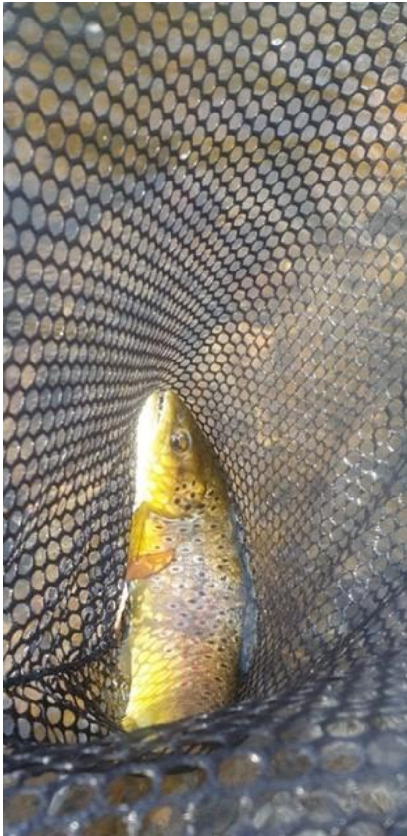
Another Trout caught by one of Craig's Killer Flies !!!