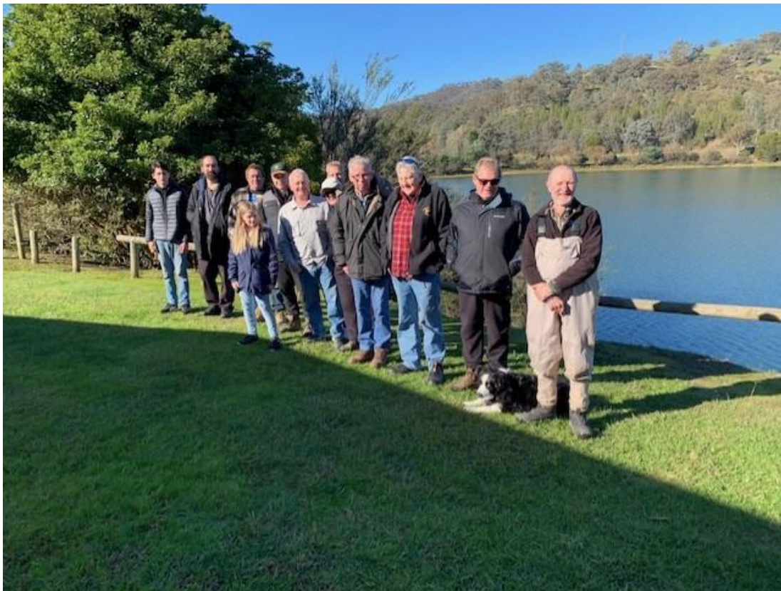
YVFF Members on the Eildon Pondage Club Trip June 2019.